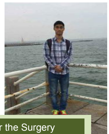
After the Surgery