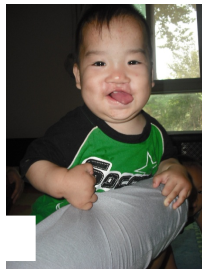
AFTER THE SURGERY