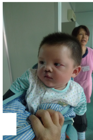
AFTER THE SURGERY