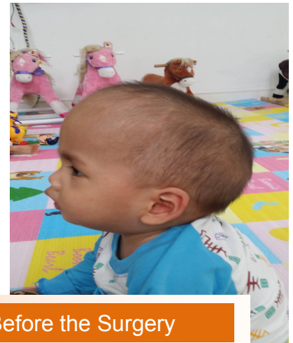
Before the Surgery

*It is a sum of medical fee and feeding home expenses incurred between May 2015 and July 2015.