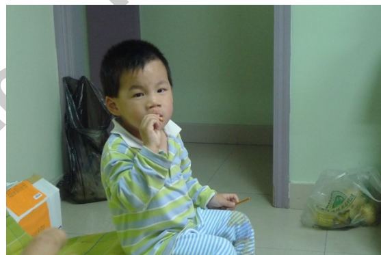
BEFORE THE SURGERY