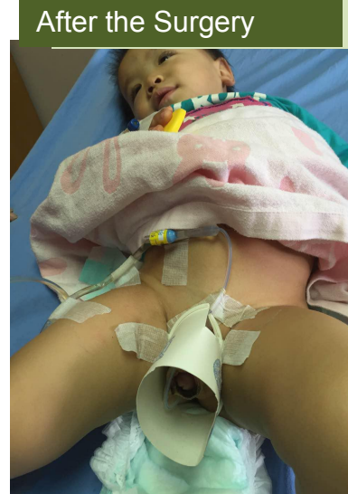
After the Surgery