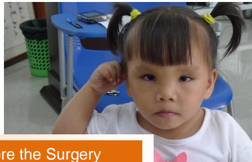
Before the Surgery