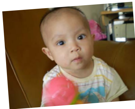
Before the Surgery