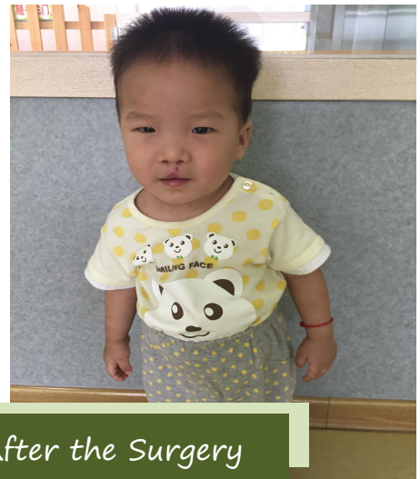
After the Surgery