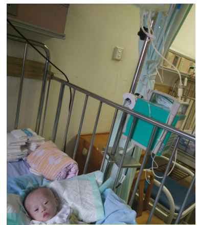
After the Treatment