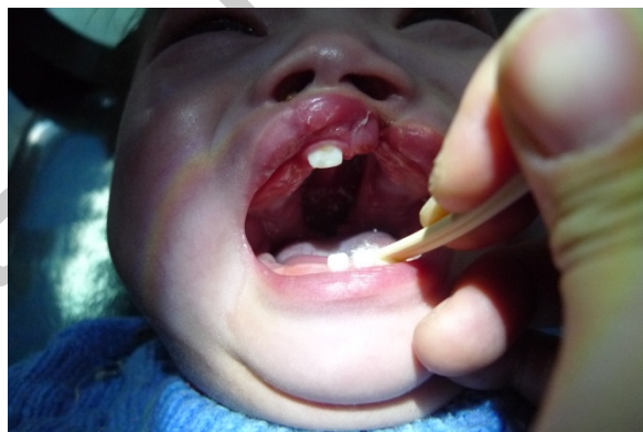
BEFORE THE SURGERY