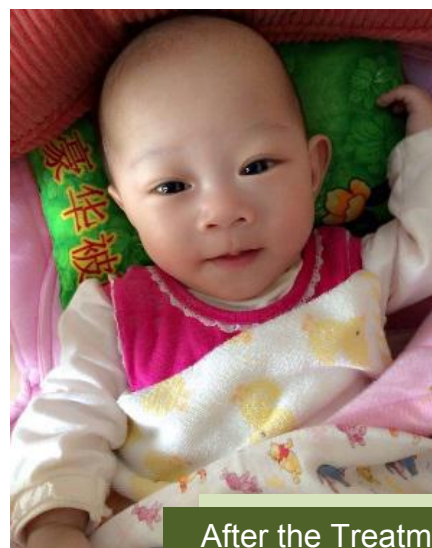
After the Treatment