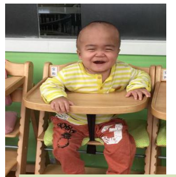
After the Surgery