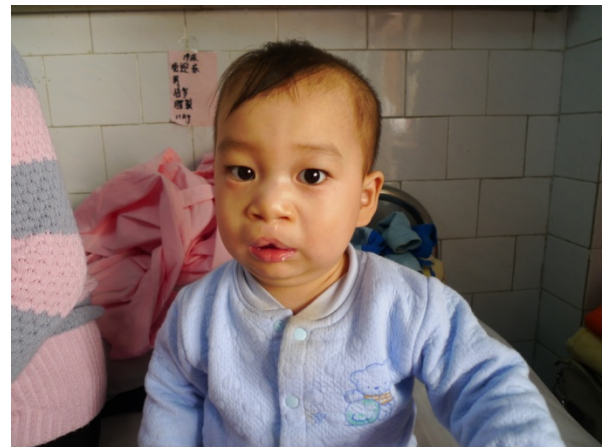
AFTER THE SURGERY

Date of Surgery: 23 Feb 2012 Medical Fee: RMB 5,187.88