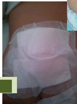
After the Surgery