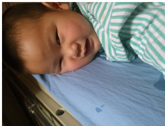
Before the Surgery