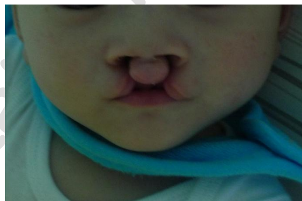
BEFORE THE SURGERY