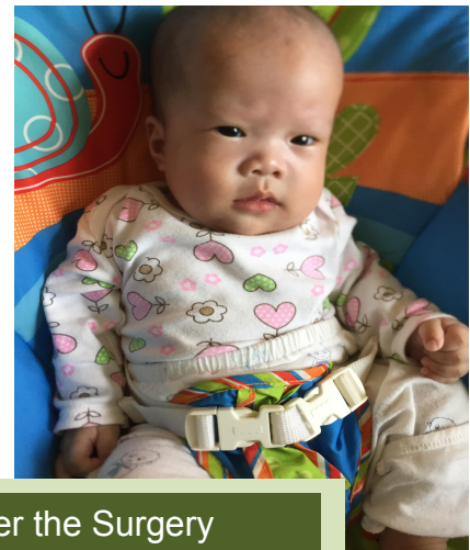
After the Surgery