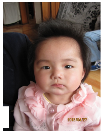
AFTER THE SURGERY