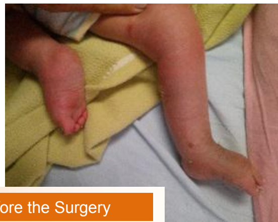
Before the Surgery