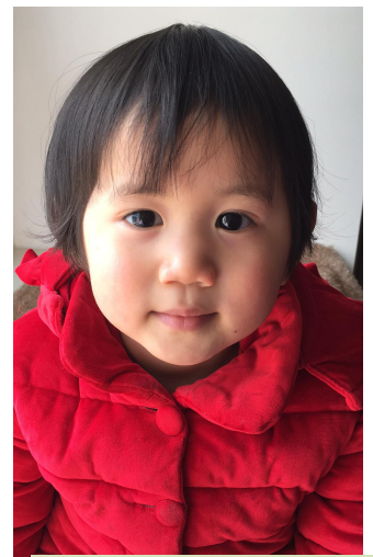
After the Treatment