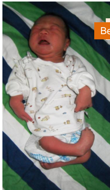
Before the Surgery