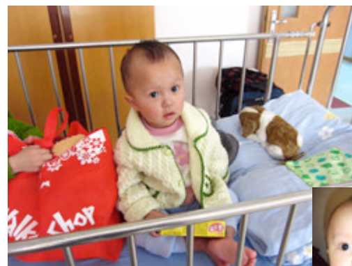
After the operation