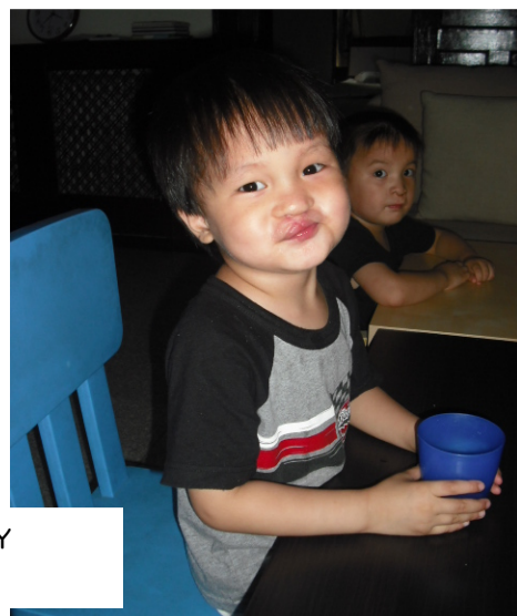
AFTER THE SURGERY