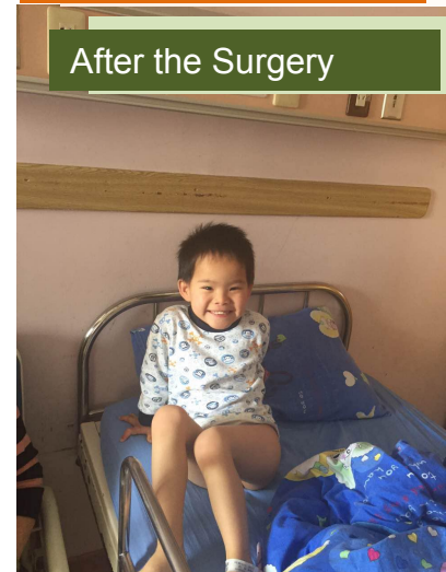
After the Surgery