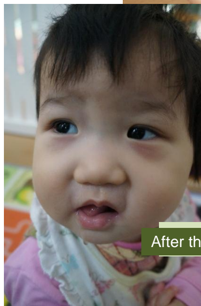
After the Surgery