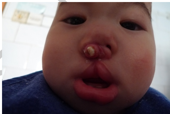
BEFORE THE SURGERY