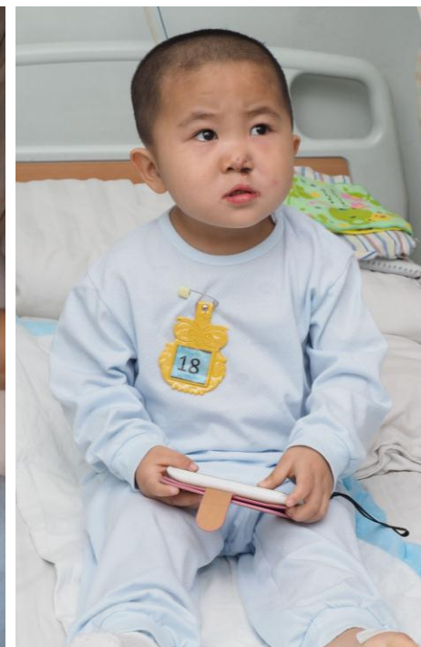
After the Surgery