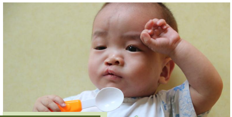
After the Surgery