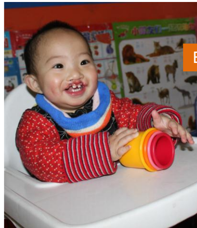
Before the Surgery