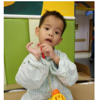
Before the Surgery