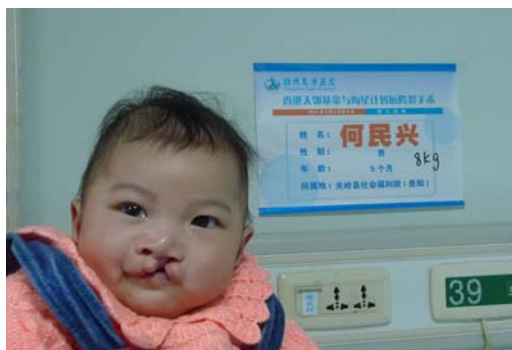
Before the Surgery