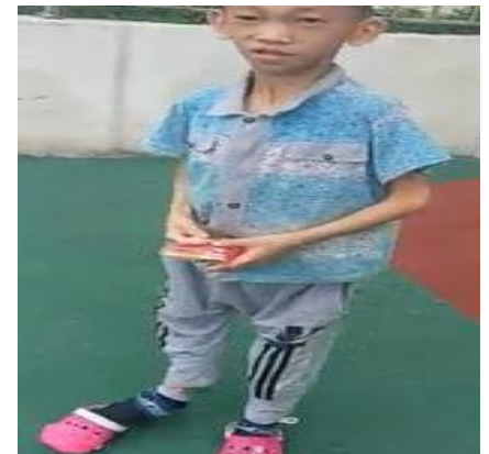
Before the Surgery

* The above fee is the second surgery fee.