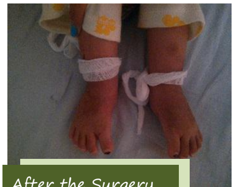
After the Surgery